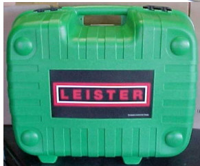
LEISTER TOOL BOX 126.448