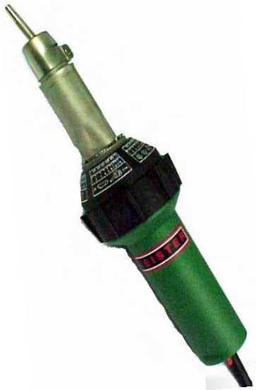
LEISTER TRIAC S WELDER