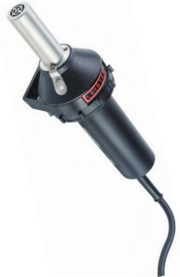
LEISTER HOT JET S WELDER