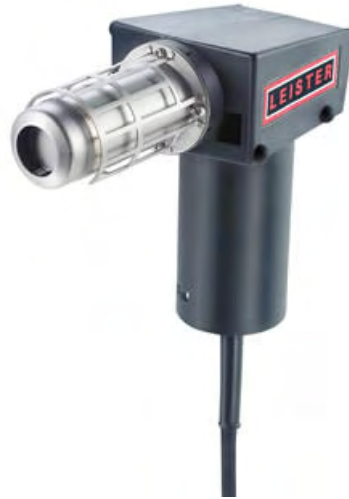
LEISTER GHIBLI WELDER