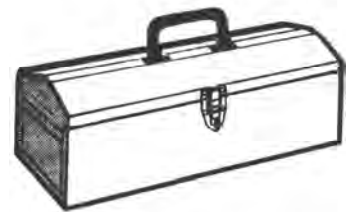
METAL TOOL BOX