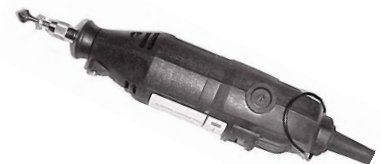
WDD 765 GRINDER with TIP

IN SIZES TO MATCH YOUR NOZZLE CHOICE WELD ROD ASSORTMENT IN PLASTIC BAGS