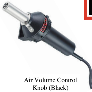
Air Volume Control Knob (Black)

Includes standard nozzle 120V / 460W 50 / 60 Hz temperature F 80—1200 Air flow Adjustable up to 80 l/min. Pressure stat. Pa ca. 1600 (16mbar) Noise level 59 dB Weight 1.5# with cord Size 9" x 2.5" 1.5"Dia. handle