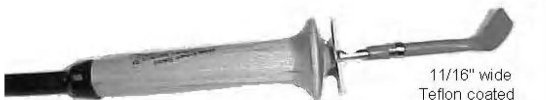
11/16" wide Teflon coated curved tip WDD 715R