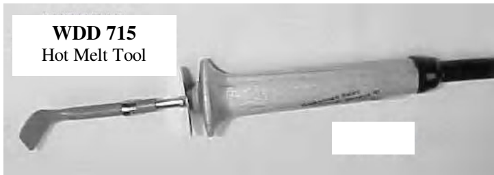
WDD 715 Hot Melt Tool