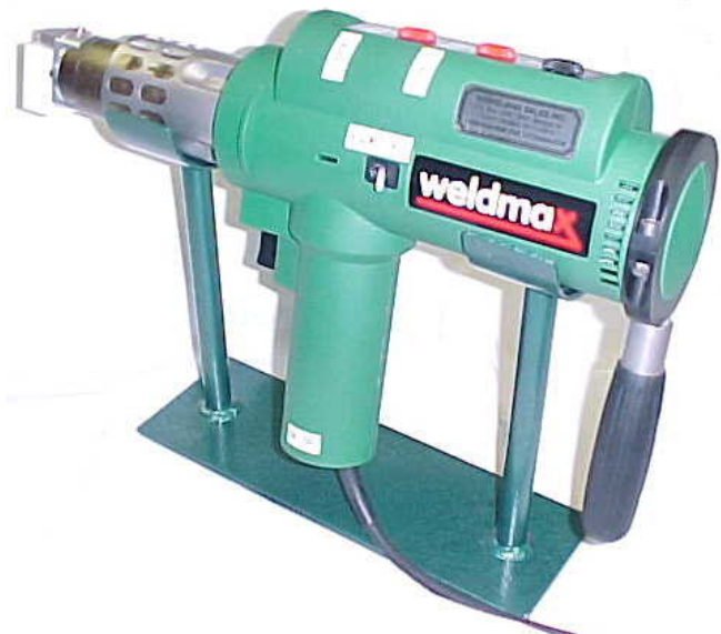
WELDMAX ON TOOL REST WDD804