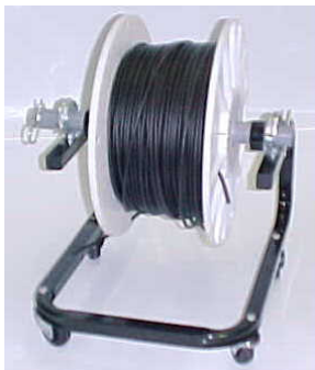
WDD668 SPOOL HOLDER